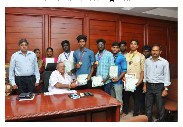
KSRCAS Wrestling Team

Our KSRCAS Men's Team Won Overall Runners UP Position for the Wrestling Tournament Conducted by Periyar University.