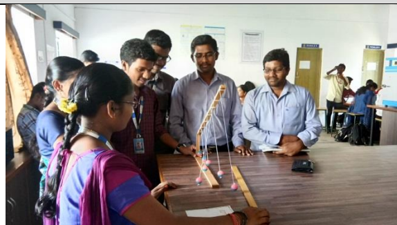
Games to promote experiential learning Department of Physics