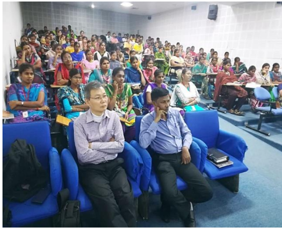
A guest lecture on NUMBER THEORY held on 11 January 2018 Venue: C Block (A/C Gallery Hall)