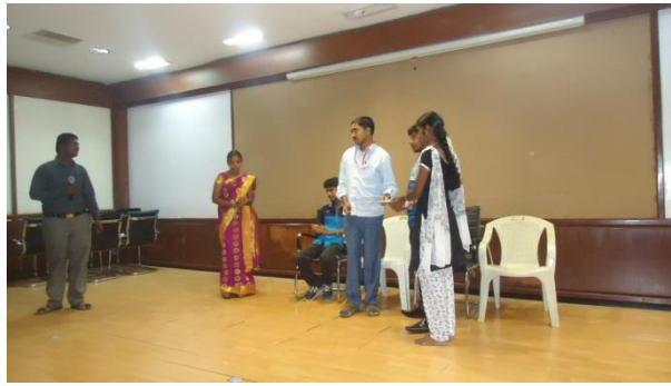
Role Play Department of Physics Academic Year 2018 – 2019