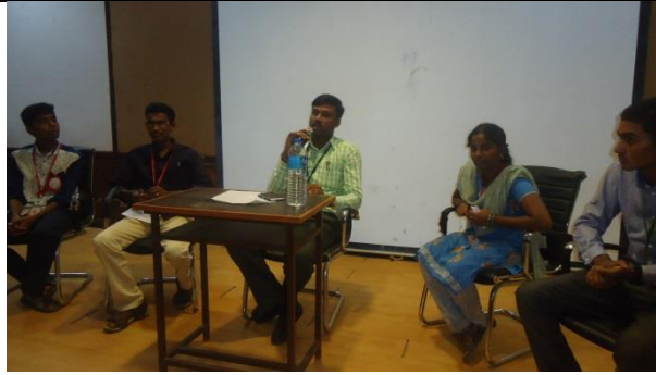
Debate Department of Physics Academic Year 2017 – 2018